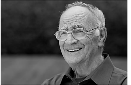
The Number 1 Reason Banks Don't Recommend Reverse Mortgages NewRetirement Blog