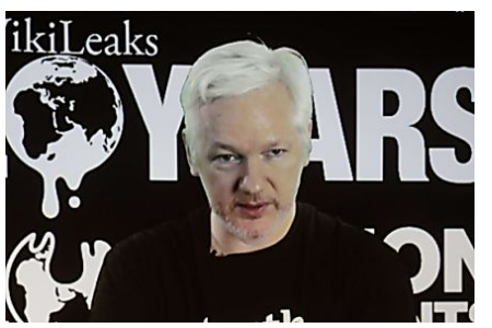
WikiLeaks' Assange vows to release 'significant' documents before US election